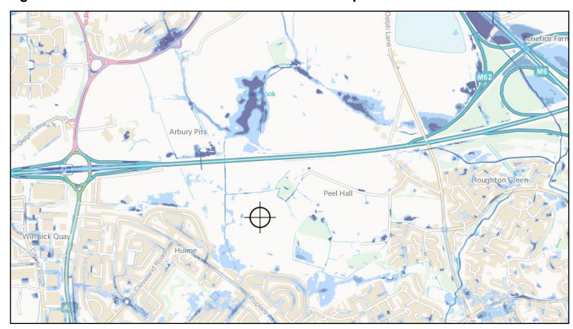
Figure a - EA Indicative Surface Water Flood Risk Map - Peel Hall

7.3.11 This section of the Environmental Statement remains unchanged.