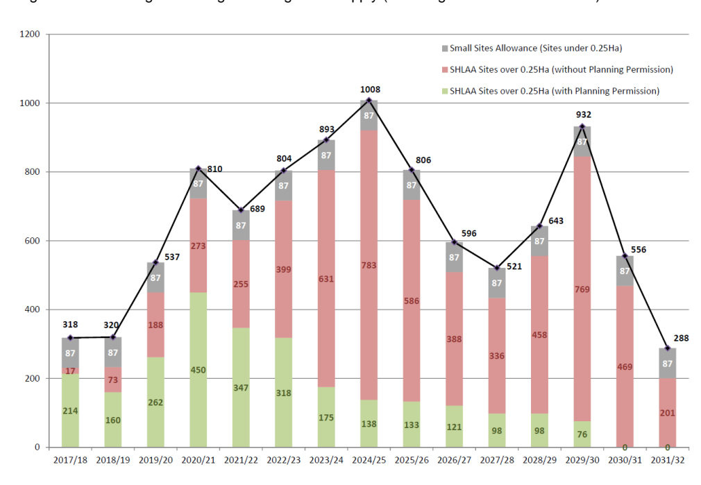
Figure 13.5 Warrington Borough Housing Land Supply (including Small Sites Allowance)